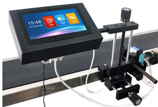
print in front